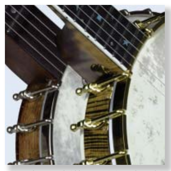
Open-Back Minstrel/Old-Time (L) & Traditional (R)