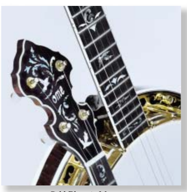
Gold Phoenix Megatone