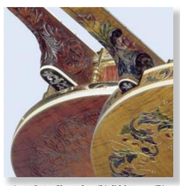
Artist Series Classic Jazz (L) & Megatone (R)

For those who prefer an extraordinary instrument of exceptional beauty, quality, and value, OME offers the "limited edition" ARTIST SERIES banjos. They are offered in the Renaissance , Mogul , Magician , Millennium , Hummingbird , Spring , and Wildflower models and in most 4 and 5-string styles.