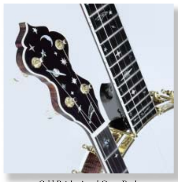
Gold Bright Angel Open-Back