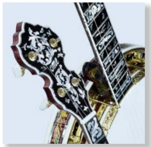
Grand Artist Spring/Renaissance Megatone