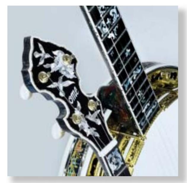
Grand Artist Hummingbird Megatone