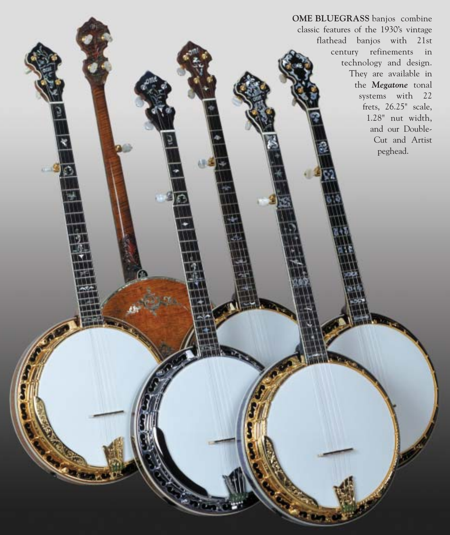
BLUEGRASS models shown (L to R): Gold Phoenix, Grand Artist Renaissance, Silver Sweetgrass, Gold Monarch, Grand Artist Millennium, and Gold Juggernaut