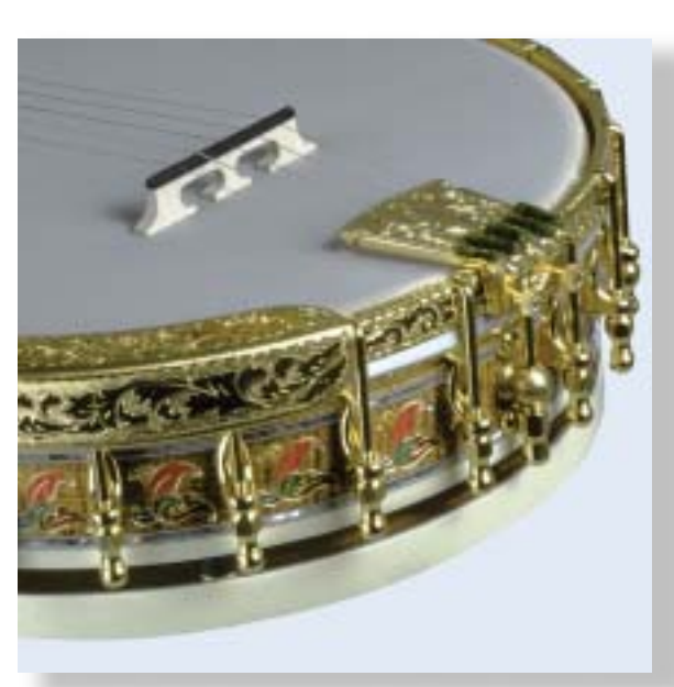
Grand Artist Open-Back w/ Flushfit Resonator and Sweetone tailpiece