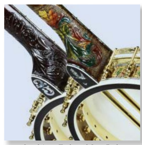
Grand Artist Traditional Open-Backs