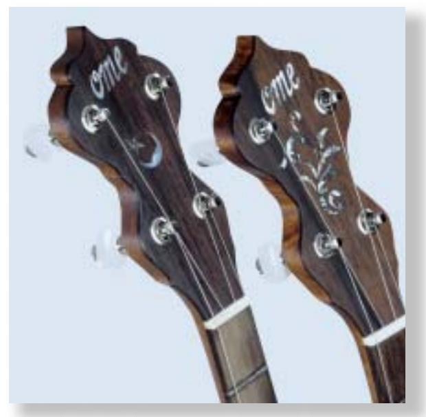
Victorian pegheads: Jubilee (L) and Juniper (R)