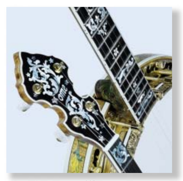
Artist Series Wildflower Megatone