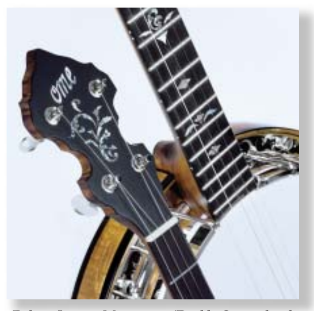
Deluxe Juniper Megatone w/Double-Cut peghead