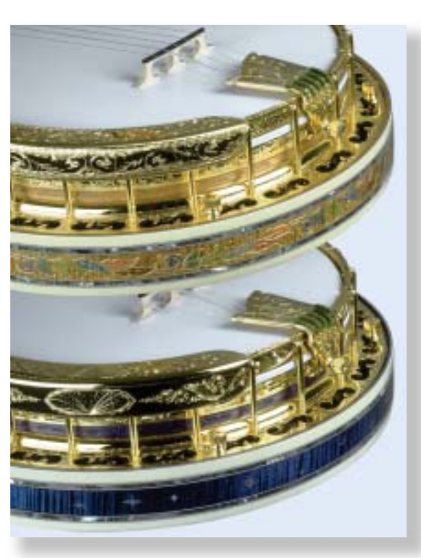
Grand Artist Megatones