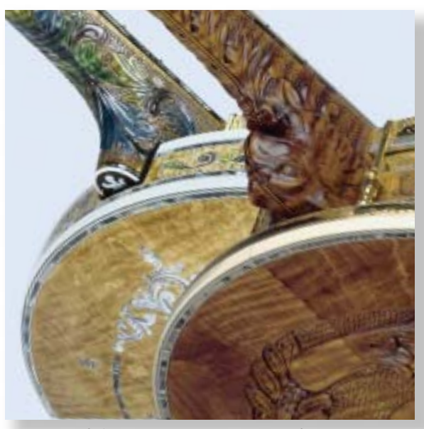
Grand Artist Megatone (L) & Classic Jazz with Gryphon heel (R)