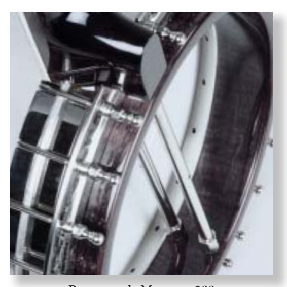
Pre-war style Megatone 200

The OME pre-war style Megatone 200 is standard on our Vintage , Professional , and Custom Series Bluegrass banjos, while the Megatone 400 is used on the Artist and Grand Artist Series .