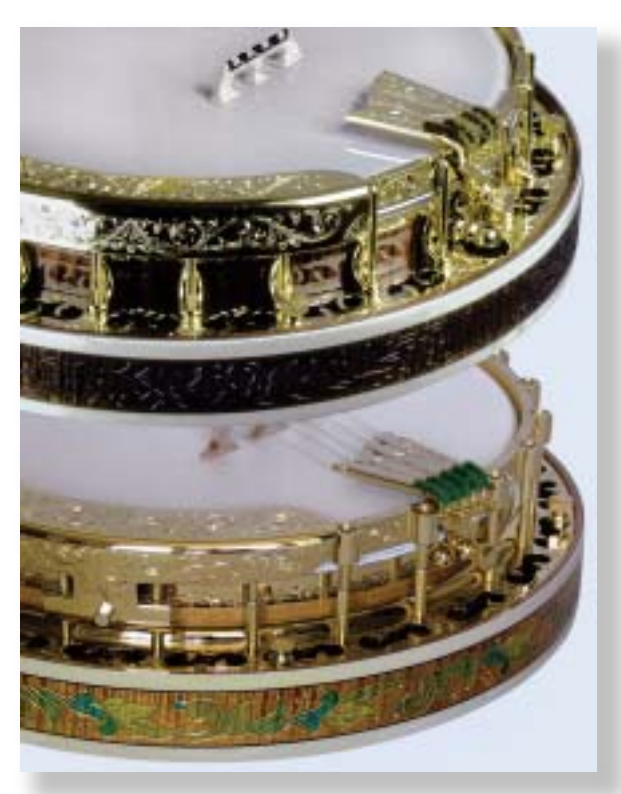
Artist Series Standard Jazz (top) & Top-Tension Megatone (bottom)