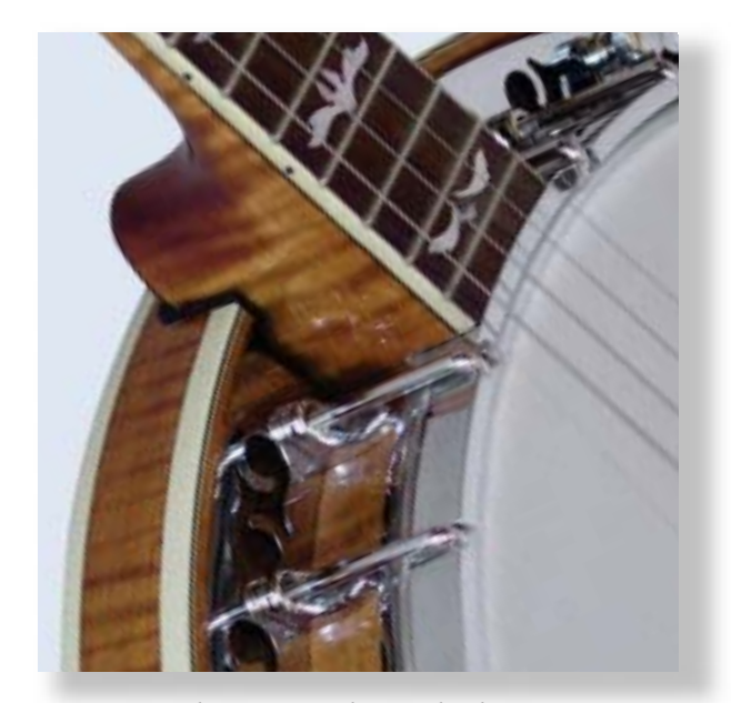
Silver Monarch Standard Jazz

OME tenor, plectrum, tenor/plectrum, Irish tenor, and guitar banjos are also offered in Open-Back styles as described on pages 4 and 5.