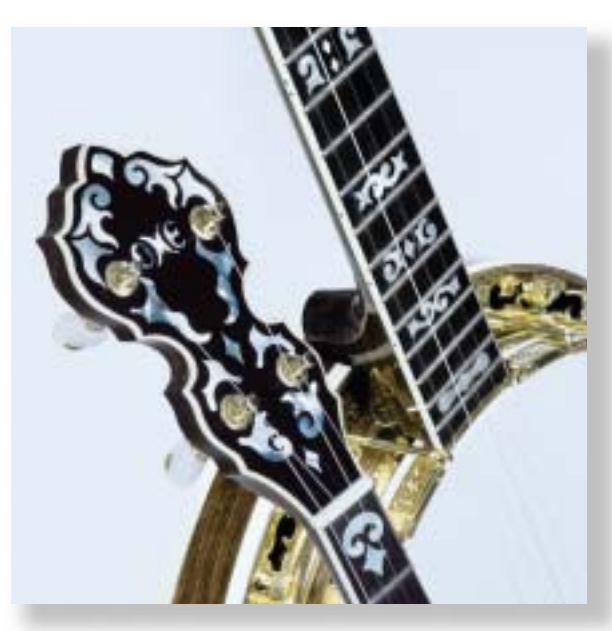
Gold Juggernaut Megatone

Premium-grade woods, exotic inlays, carefully refined appointments, and a wide range of desirable options create our popular CUSTOM SERIES. They are offered in the Juggernaut , Columbine , Phoenix , Bright Angel , Primrose and Odyssey models, and in most 4 and 5-string styles.