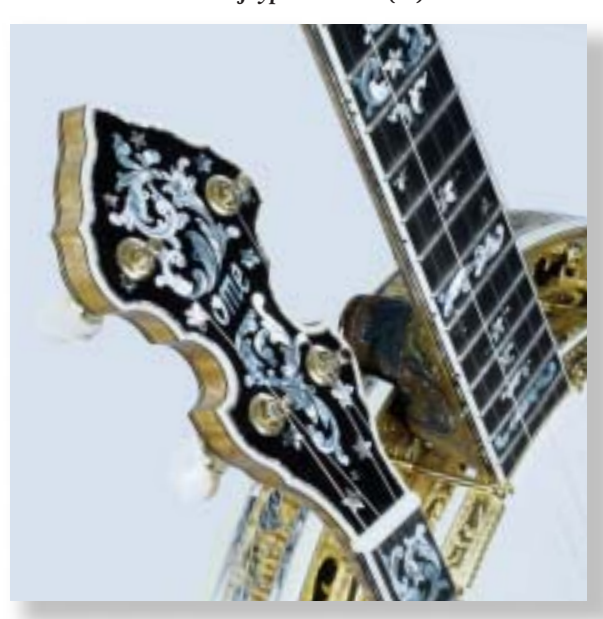
Grand Artist Wildflower Megatone