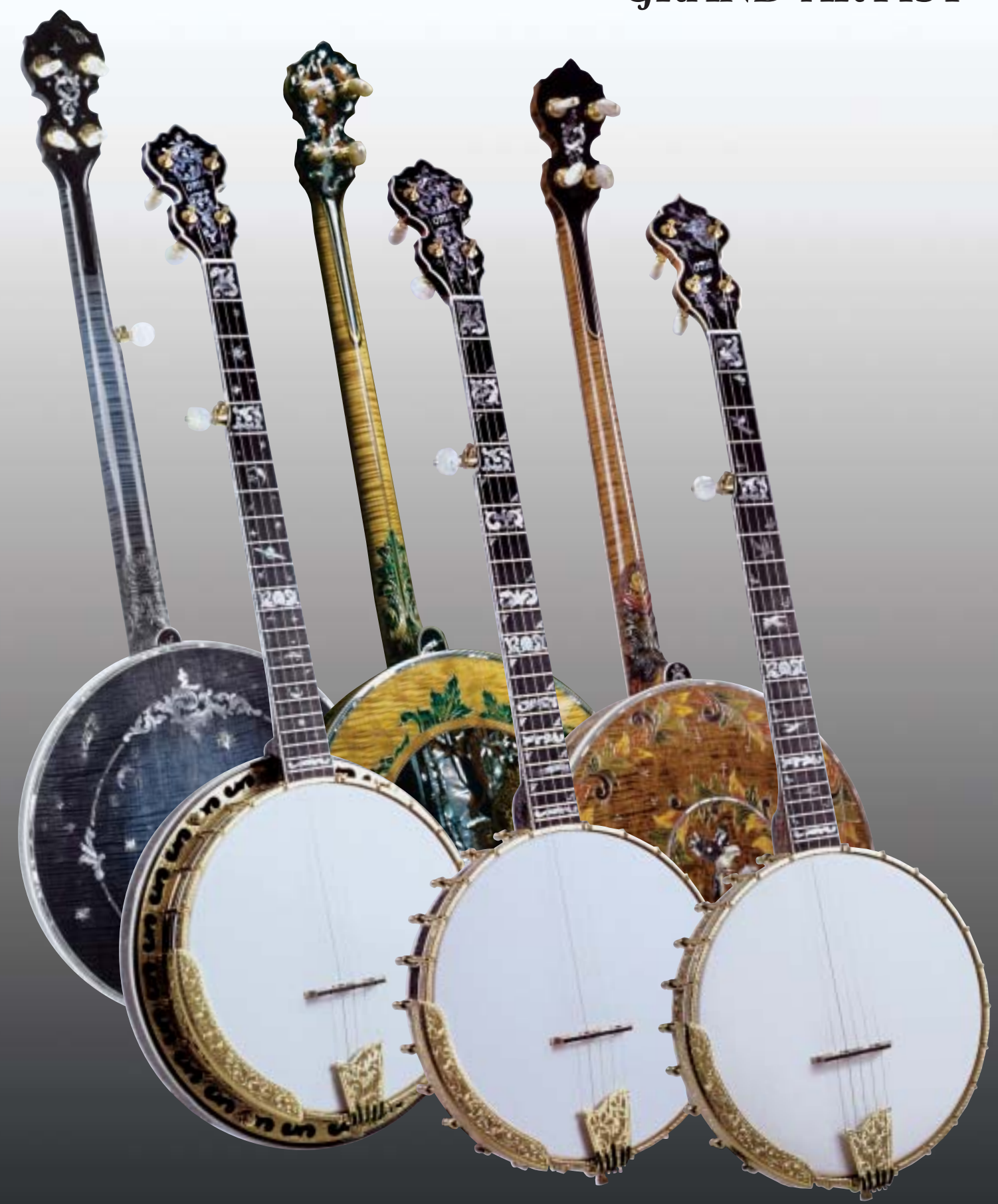
GRAND ARTIST MODELS (L to R): Millennium Megatone (front & back), Rainforest Megavox plectrum, Renaissance Open-Back, Mockingbird Megavox plectrum, and Spring/Hummingbird Open-Back