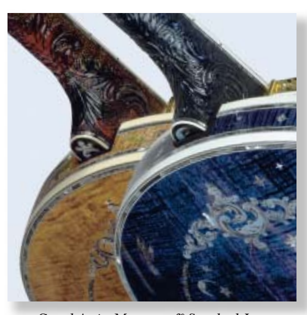
Grand Artist Megatone & Standard Jazz