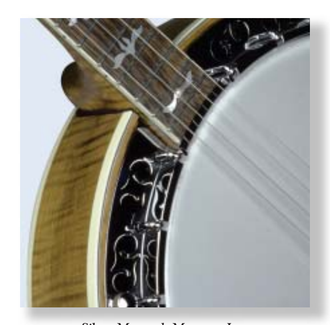
Silver Monarch Megavox Jazz

OME Classic Jazz banjos produce a clear, bright tone with more emphasis on the treble notes. They have a strong carrying power and easily cut through other instruments in a jazz band. The OME 11" Silverspun tone ring, 24 individual rim brackets, 9/16" curly maple rim, and our bell-shaped spunbrass resonator flange are standard on this style.