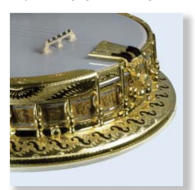
Grand Artist Classic Jazz with Harp tailpiece