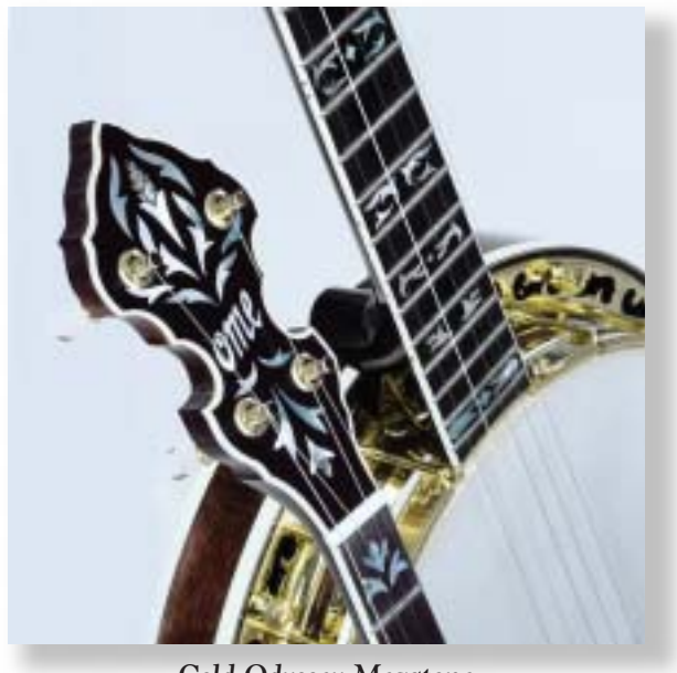
Gold Odyssey Megatone