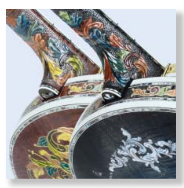
Grand Artist Megatone & Standard Jazz

Stunning beauty. Rare and luxurious materials. Unsurpassed artistry in construction, ornamentation and design. These are the qualities which establish the "one-of-a-kind" and "limited edition" GRAND ARTIST SERIES as the ultimate choice for those with an uncompromising desire for artistic excellence. They are offered in most 4 and 5-string styles.