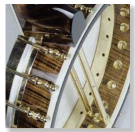
Traditional Silverspun Open-Back

Traditional open-backs are offered in both the 11" and 12" body size with our optional scooped fingerboard, Megatone sand-cast flathead tone ring, and Flushfit resonator for increased resonance and volume. All Open-Back banjos are available in 4, 5, and 6-string styles.