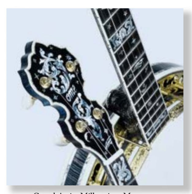
Grand Artist Millennium Megatone