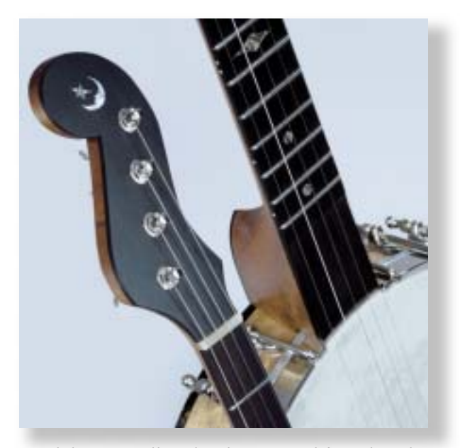
Jubilee w/Scroll peghead & scooped fingerboard

VINTAGE SERIES banjos combine elegant simplicity with classic design and construction to offer a quality, hand-made instrument at a modest price. They are available in the Jubilee , Deluxe Jubilee , Juniper , and Deluxe Juniper models.