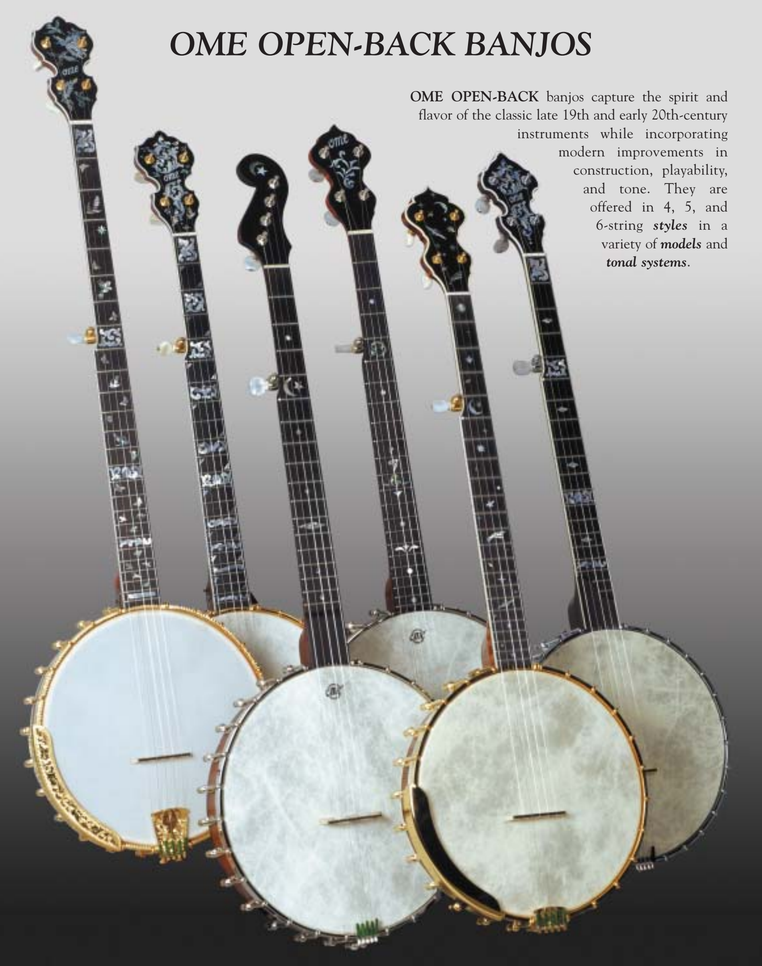
OPEN-BACK models shown (L to R): Grand Artist Spring/Hummingbird (long-neck), Grand Artist Renaissance, Minstrel Jubilee, Old-Time Juniper, Gold Bright Angel, and Silver Magician