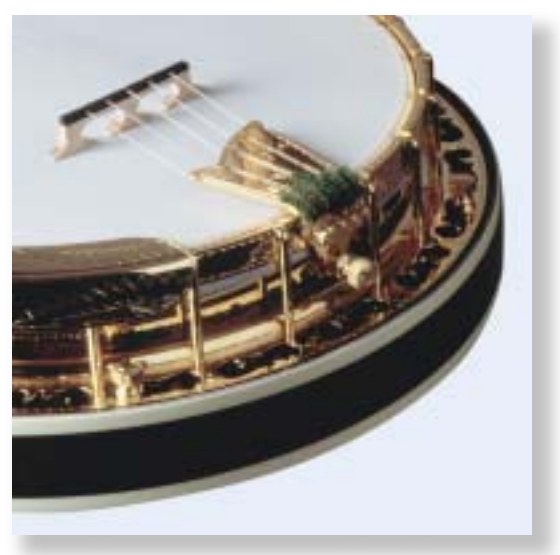
Snuffy Smith bridge & Harp tailpiece

Megatone options include the OME sand-cast, bell-bronze archtop tone ring, top-tension construction, radiused fingerboard, and our old-growth water-cured maple rims.