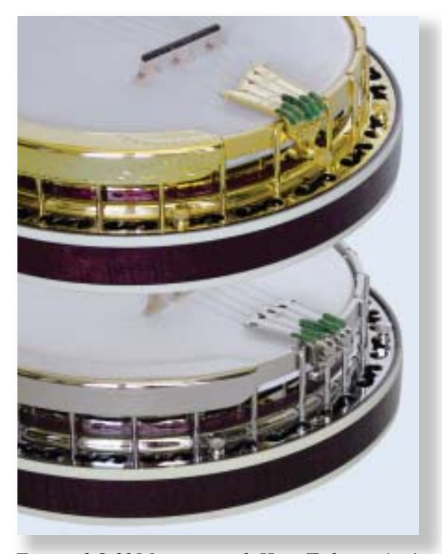
Engraved Gold Megatone with Harp Tailpiece (top) Nickel Megatone with Sweetone Tailpiece (bottom)