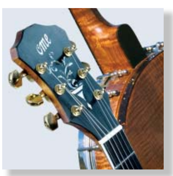
Sweetgrass guitar (L) & Flushfit resonator (R)

OME Traditional banjos offer increased sustain, resonance, and response throughout the entire playing range. They feature a 9/16" curly maple rim with our Silverspun brass and steel tone ring and are standard on Professional , Custom , and Artist Series open-back models.