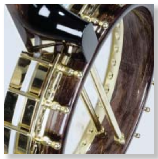
OME Megatone 400

These instruments produce an exceptionally rich, full tone with brilliant treble, deep full bass, and balanced response throughout the entire playing range. The Megatone's rapid tone decay suppresses unwanted overtones and provides optimum note separation for clear, crisp, finger-picking playing styles.