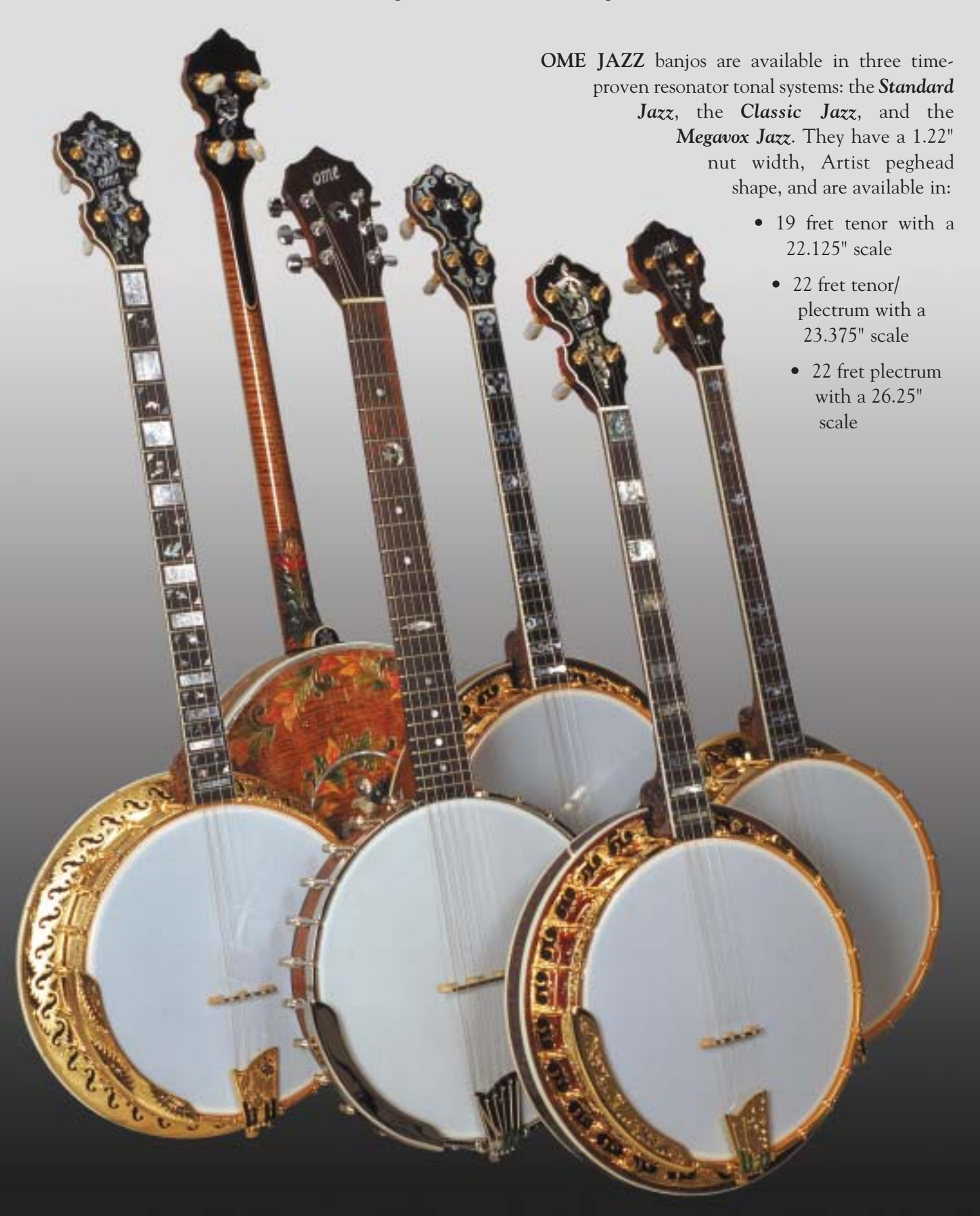
JAZZ models shown (L to R): Grand Artist Spring/Mogul Classic plectrum, Grand Artist Mockingbird Megavox plectrum, Jubilee guitar-banjo, Juggernaut Standard Jazz tenor, Mogul Standard Jazz tenor, and Monarch Classic tenor