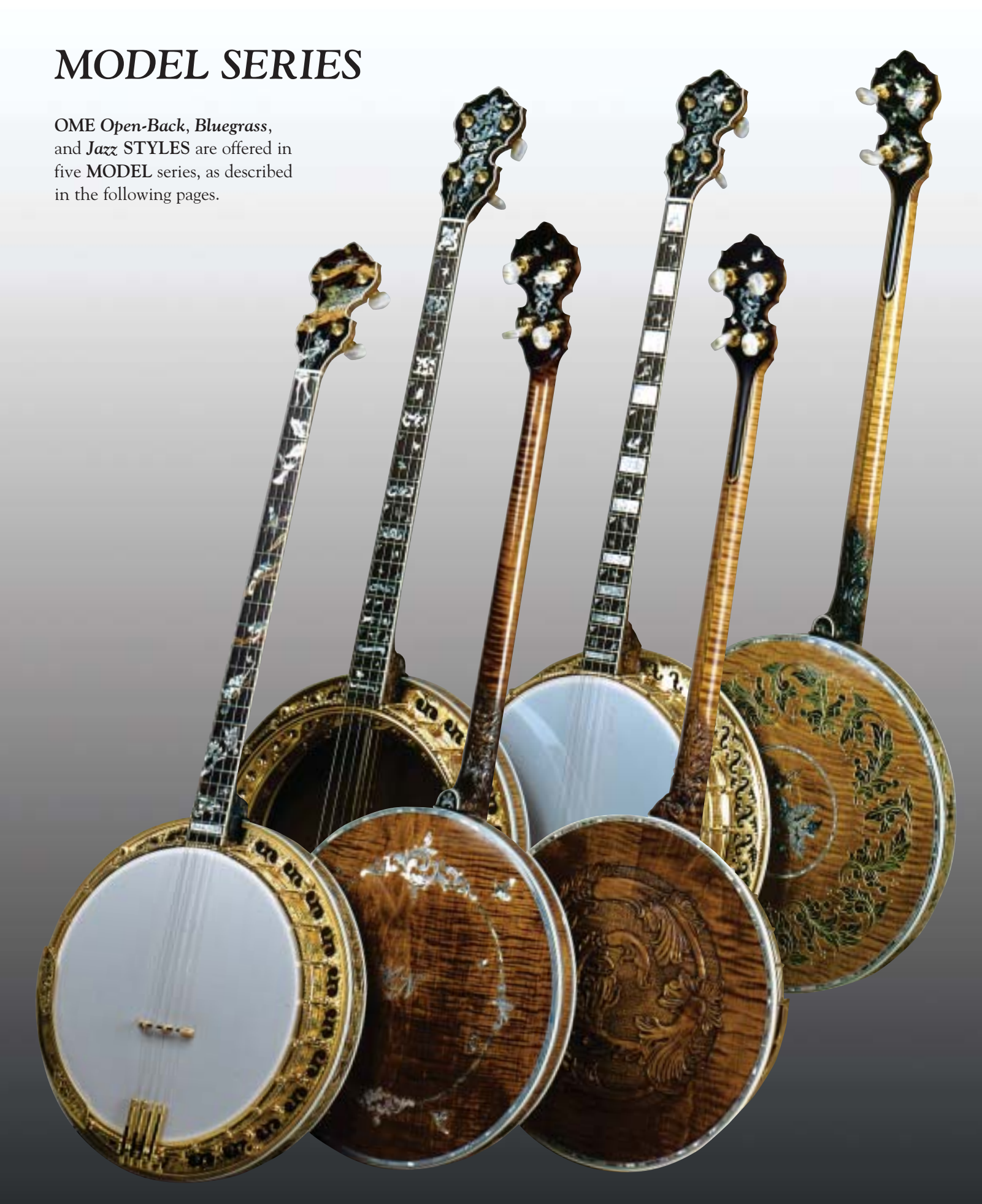
GRAND ARTIST MODELS (L to R): Rainforest Standard Jazz , Spring/Renaissance Standard Jazz (front & back), Spring/Mogul Classic (front & back), and Hummingbird Standard Jazz plectrums