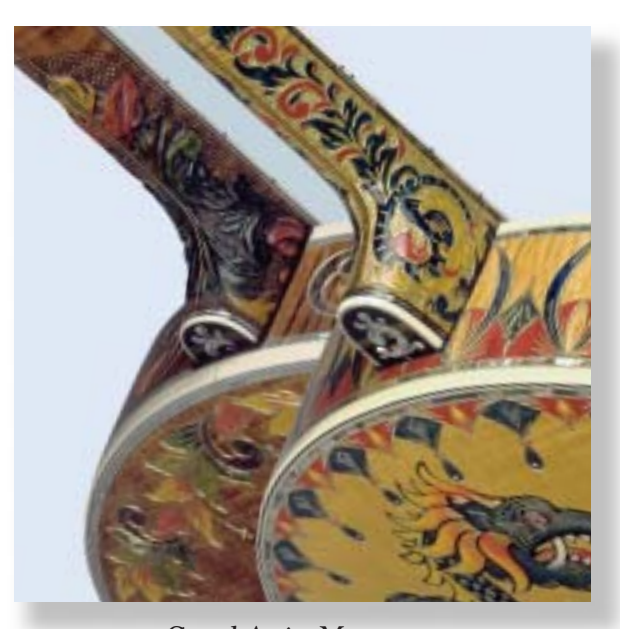
Grand Artist Megavoxes